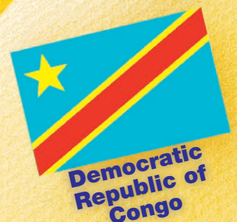
Democratic Republic of Congo